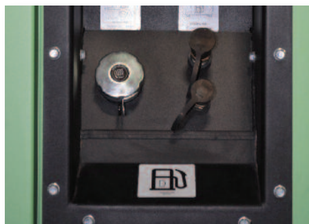
Remote Fuel Panel External fuel fill with remote fuel connections.