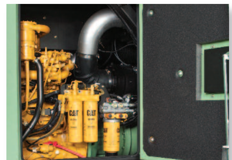
Total Accessibility Routine maintenance is simplified.