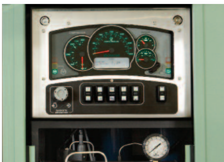
Instrument Panel Display Monitor gauges and LCD display.